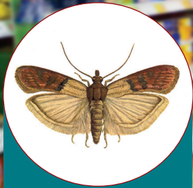
Indianmeal Moth, Plodia interpunctella

THE BEST Stand Alone Product for Industry-Wide Control of IMM and Other Species!