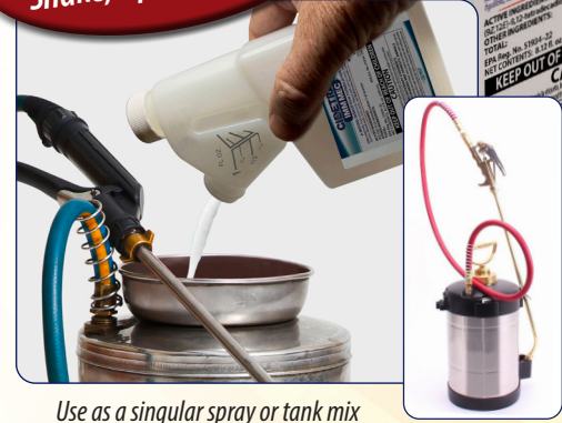
Use as a singular spray or tank mix