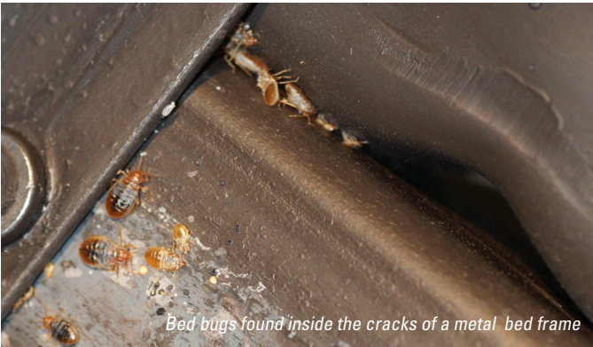
Bed bugs found inside the cracks of a metal bed frame

A: Because Bed bugs are small and flat, they are able to squeeze into tiny cracks and crevices on the mattress and box spring, behind headboards, and inside furniture. They prefer to live in groups and are often found in clusters where the adults, nymphs and eggs are together in a protected area.